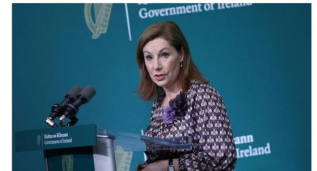
Minister of State for Special Education Josepha Madigan has come under fire for describing children without additional needs as 'normal'.