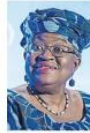
Ngozi Okonjo-Iweala, 66, ist die neue WTO-Chefin.

Laus ist auch der Ruf aus dem globalen Süden. Viele Entwicklungsländer fürchten, dass sie punkto Comenzampfangen zu kurz kommen werden. Hilfe verspricht derzeit ein Vorschlag aus Indien und Südafrika: Sie wollen den Patentschutz ihrer Impfstoffe vorübergehend aussetzen, um armen Staaten zu helfen. Die EU und andere reiche WTO-Mitglieder wollen von ähnlichem Pa-